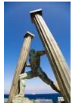
Monument to World Peace, "The Union of the World," 26 x 20 x 8 feet, 18,000 pounds

. Creates for the first time the sculptures of Medieval Muslim cartographer Al-Idrissi, the Jewish thinker Josef Ben Yehudá Ibn Aknin, the Greek geographer Strabo, the Roman geographer Pomponius Mela and the Portuguese Infante Fernando el Santo. . Gallerie Katia Granoff exhibits his art work in France (April-July, 2007). . Unveiling, in Miami, "The Union of the World" (2010). The Mayor presents him with the Keys to the City of Miami for his artistic and humanitarian contributions to the world.