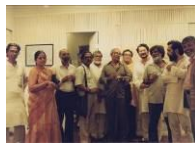
New Delhi, India