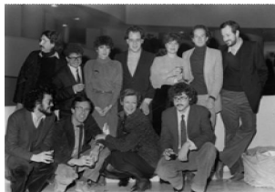
Guggenheim Museum, New York, 1980