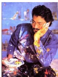
New York, 1983