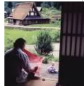
Gasho, Aino Kura

. Lives during several years in small villages in Japan: the fishing people of Uchikawa (Shinminato), the rice peasant community of Kuromaki, and uses a traditional "Gasho" as an atelier in the remote mountains of Gokayama, in Aino-Kura (Toyama).