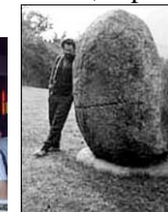
Sculptors friends, Tokyo Noguchi ashes, Mure