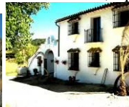
Atelier in the Sierra of Grazalema, Spain